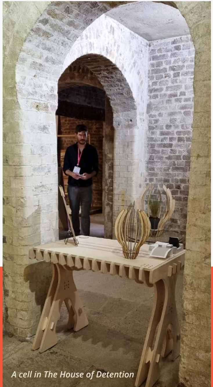
A cell in The House of Detention