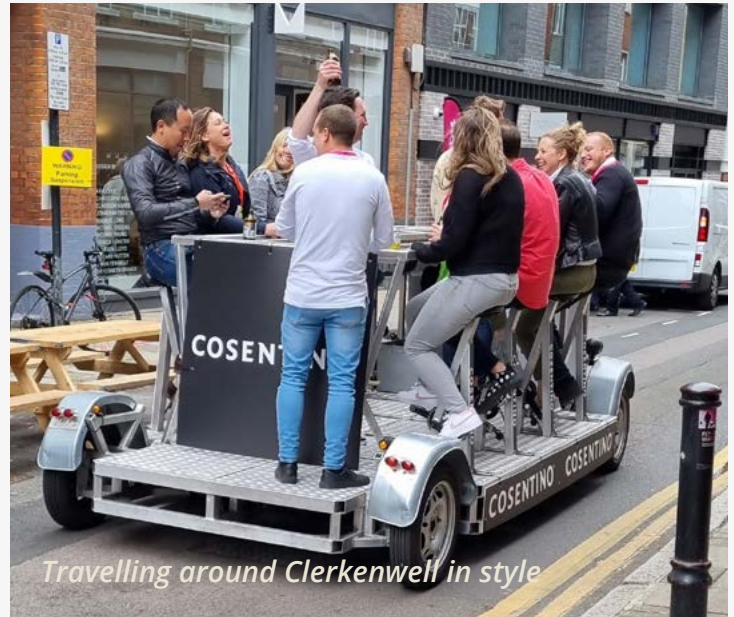
Travelling around Clerkenwell in style

One of the exhibition areas was the allegedly haunted “House of Detention” dating from 1616, - in other words, an old underground prison. The space – even the cells with their subtle lighting, were used imaginatively.