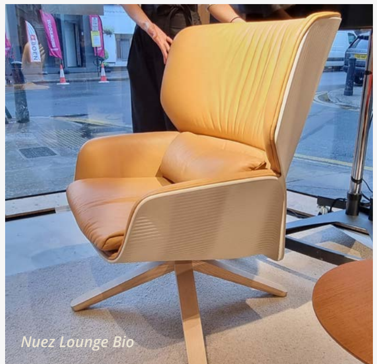
Nuez Lounge Bio