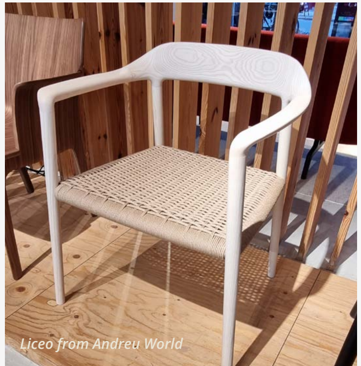
Liceo from Andreu World