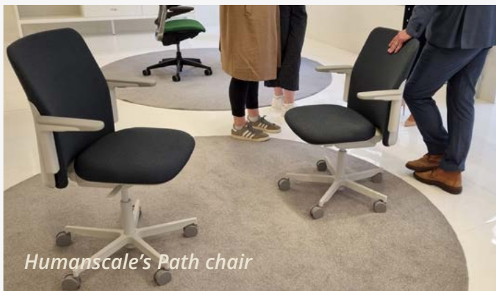
Humanscale's Path chair

Humanscale's new Path task chair is made using 4.5kg of ocean plastics and follows the company's philosophy of being self-adjustable based on the weight of the user. The company claims that, based on the materials used to make it and its manufacturing processes, the chair provides a positive environmental benefit.