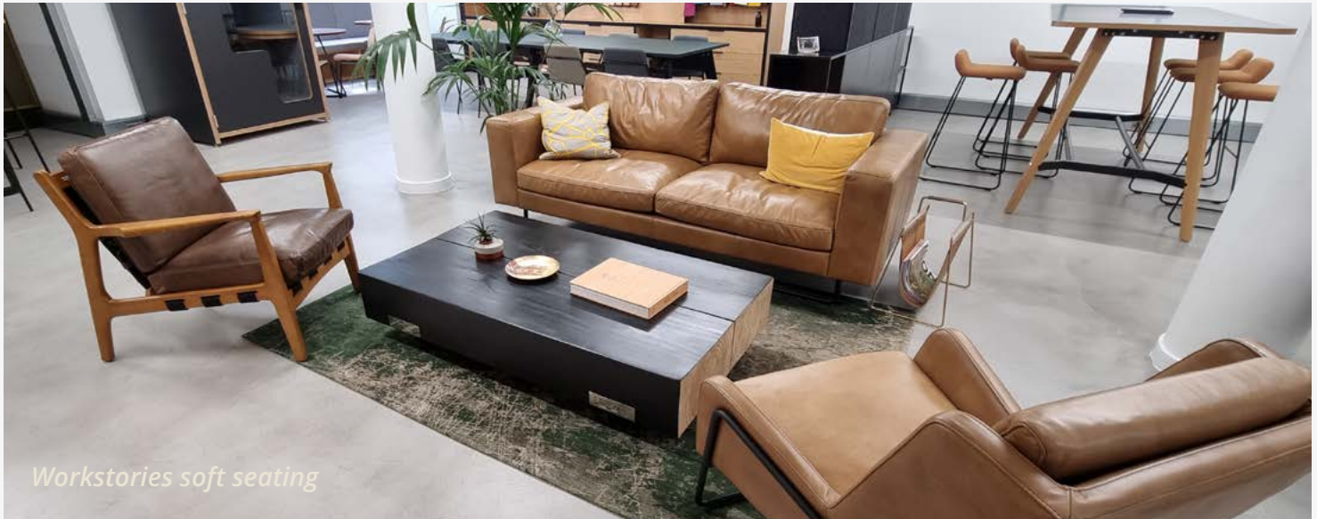
Workstories soft seating

Workstories , the British workspace furniture company showed some attractive, and fashionable soft seating in their attractive Clerkenwell showroom.