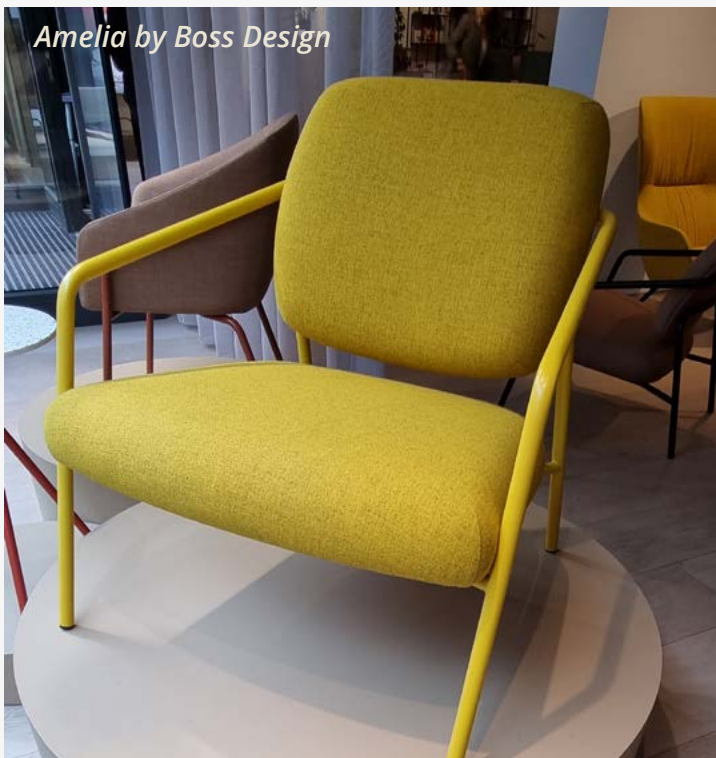
Amelia by Boss Design

Boss Design's large attractive showroom had a wide range of new products including Amelia from the company's own design team led by Mark Barrell. The chair featured bent steel tubing which environmentalists are increasingly favouring over aluminium, based on aluminium requiring nearly ten times as much energy to produce, tonne for tonne, as steel.