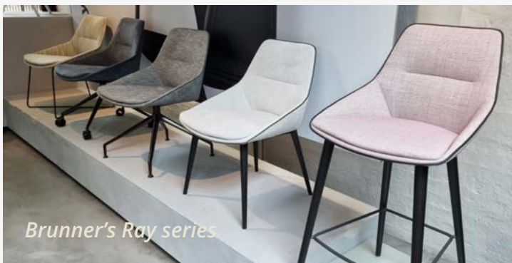
Brunner's Ray series

The German company, Brunner , has a very successful business in the UK with attractive, high-quality products. Their large showroom showed their new Ray series of side chairs with a selection of bases, designed by Jehs+Laub.