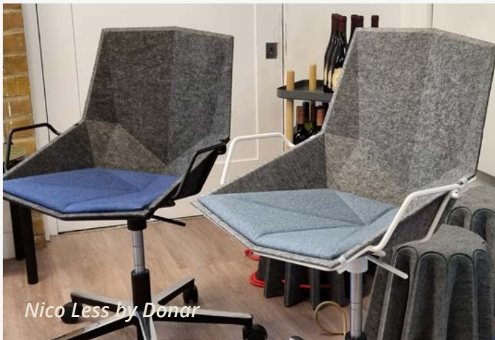
Nico Less by Donar