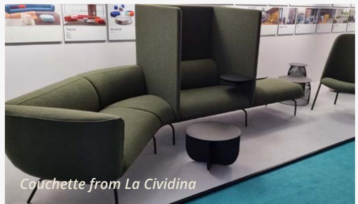
Couchette from La Cividina

Italian makers La Cividina from near Udine showed their interesting Couchette soft seating units designed by Lucidi Pevere.