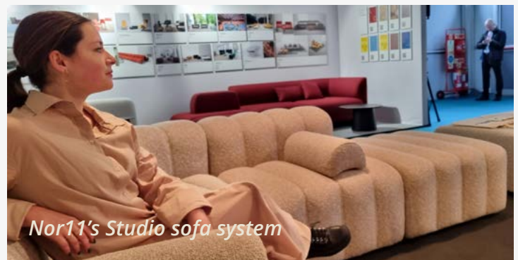
Norr11's Studio sofa system